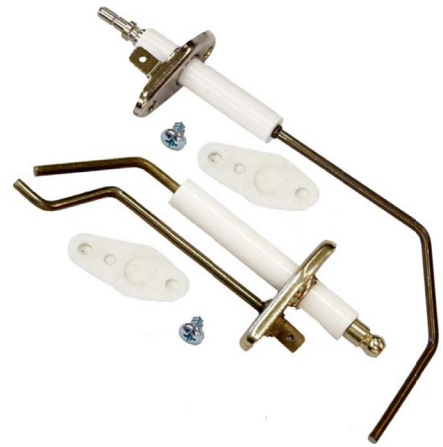
Typical components of a Maintenance Kit

For further information visit aerco.com .