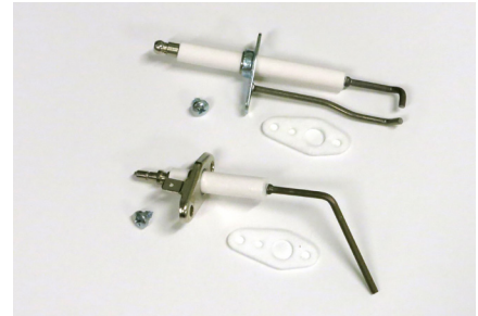
Typical components of a Maintenance Kit

For further information visit aerco.com .