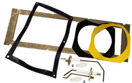
Typical components of a Fireside Inspection Kit