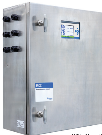
MCX - Monochloramine Analyzer

When a continuous process stream of water is flowing through the MCX, the instrument will take samples at preset intervals and display the readings. Reporting is made easy with a built-in display/control screen, along with standard 4-20mA outputs or Modbus communication outputs for instant data transfers.